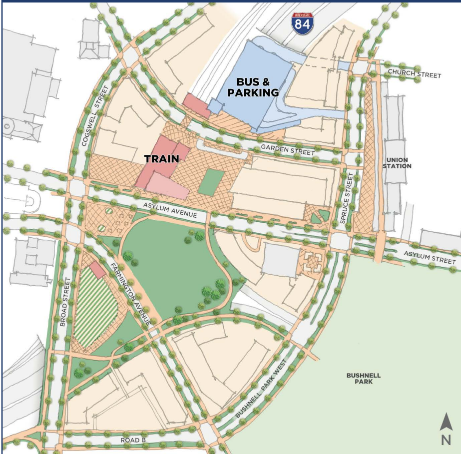
Northern Concept E1, so named due to its position north of Asylum Avenue, sites the multi-modal station as well as the bus and parking facilities, on capping north of an extended Garden Street.

Together with the City of Hartford, the I-84 Hartford Project Team is planning a new rail and bus station. It will serve not only as a gateway to the city, but as a link that helps mend the divide caused by the railroad and highway.