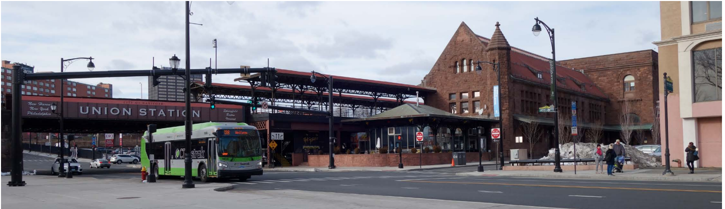
Union Station is one of many American rail stations that may undergo renovation as travel modes and preferences evolve.

Weathering a destructive fire and numerous remodels, the historic station is poised for yet another reinvention