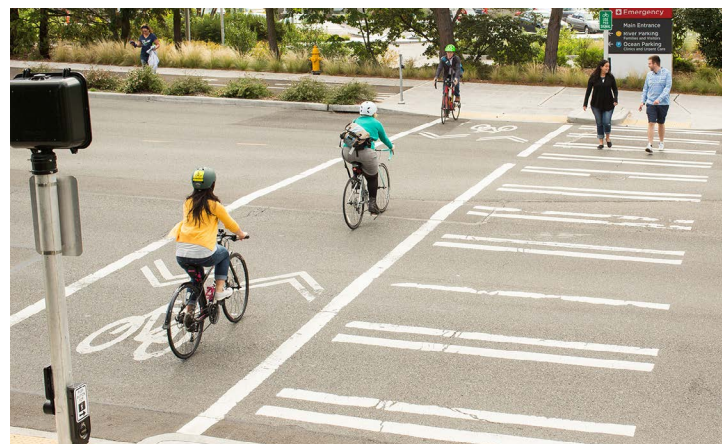
Two community members provided a thoughtful proposal for the multi-modal station area, including provisions for CTfastrak, pedestrians, bicyclists, and developable land.

travelers take note; we love your ideas! They ensure that this remains your city, your highway, and your solutions.