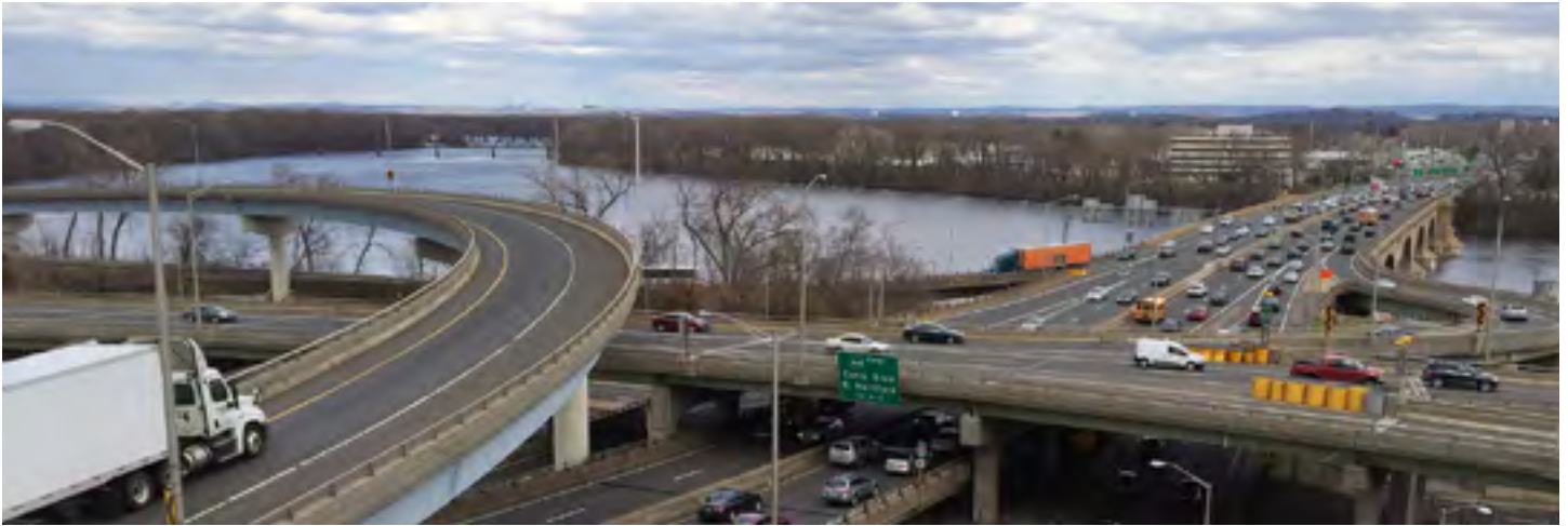
Traffic at the interchange where I-84 meets I-91 frequently backs up. Tight constraints between the Connecticut River and downtown Hartford development, coupled with fewer lanes in both directions, create major bottlenecks. The I-84/I-91 Interchange Study will explore ideas to improve the traffic flow and safety of this area.

From the beginning of the I-84 Hartford Project, the public has shared concerns about the traffic bottleneck where I-84 crosses the Connecticut River into East Hartford.