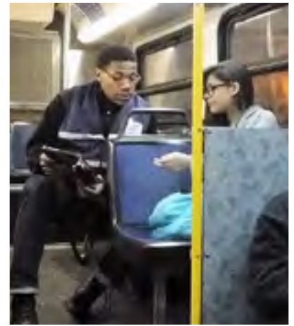
Locals were hired for the Onboard Bus Survey team, gathering information about CTtransit bus ridership and usage.

Building a better I-84 corridor requires studying all travel modes. We've written a lot about the highway, bike facilities, and attractive environments for pedestrians, but what about transit users? The project team has been studying Hartford's bus network behind the scenes for months, and began an onboard bus survey in March.